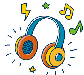
listen to music