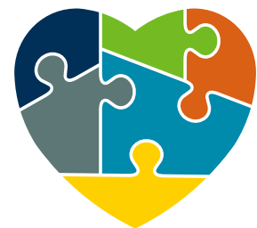
do a puzzle