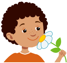
take deep breaths