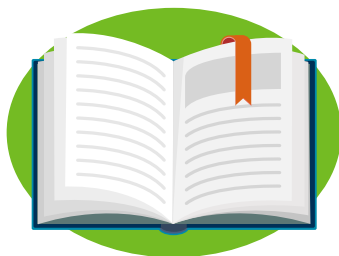
read a book