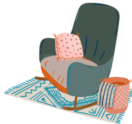
take a break