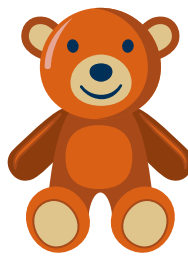
hug a favorite toy