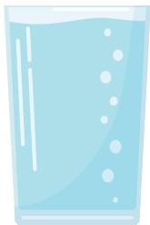
take a drink