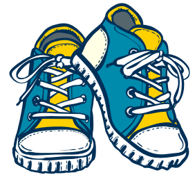
go for a walk